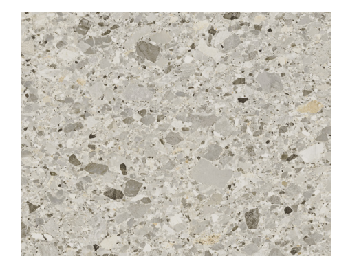
SALAR Anti-slip 50x100