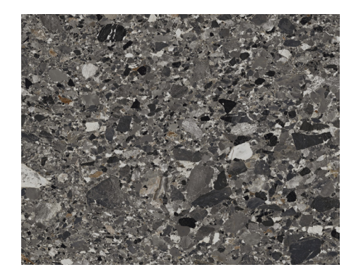
CLIFF Anti-slip 50x100